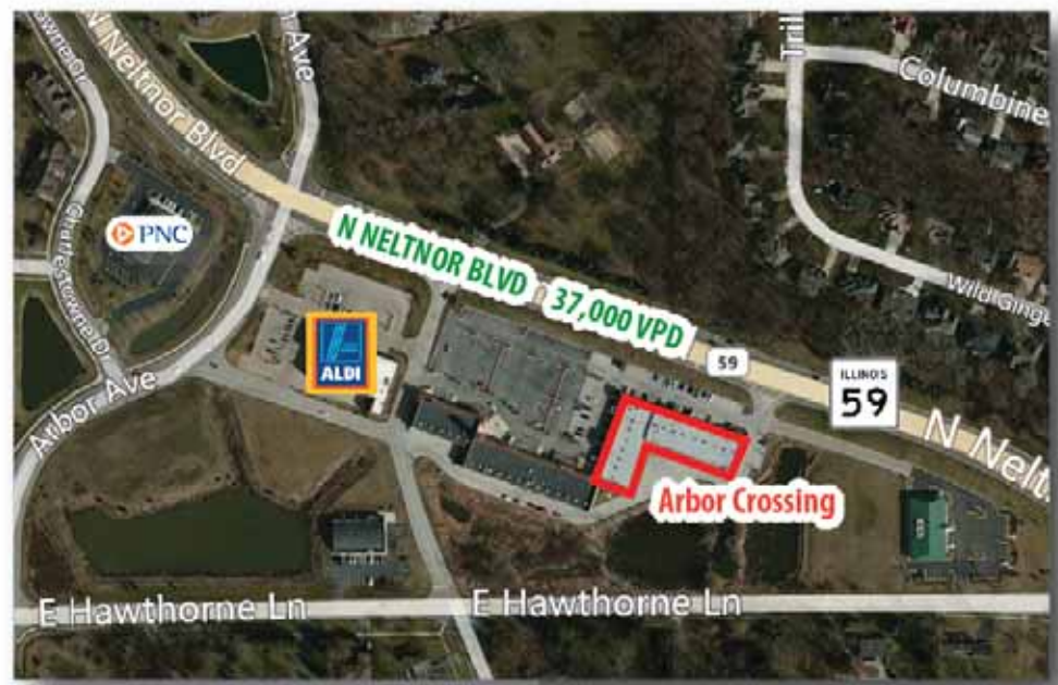
Site Plan SCALE: 1" = 20'-0"