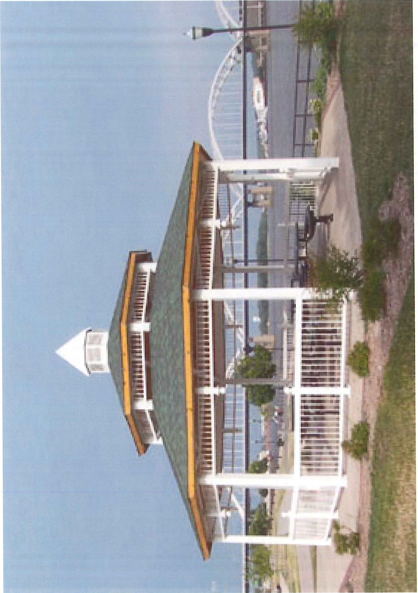
GCO2 28 W/ OPTIONAL CUPOLA AND ORNAMENTATION