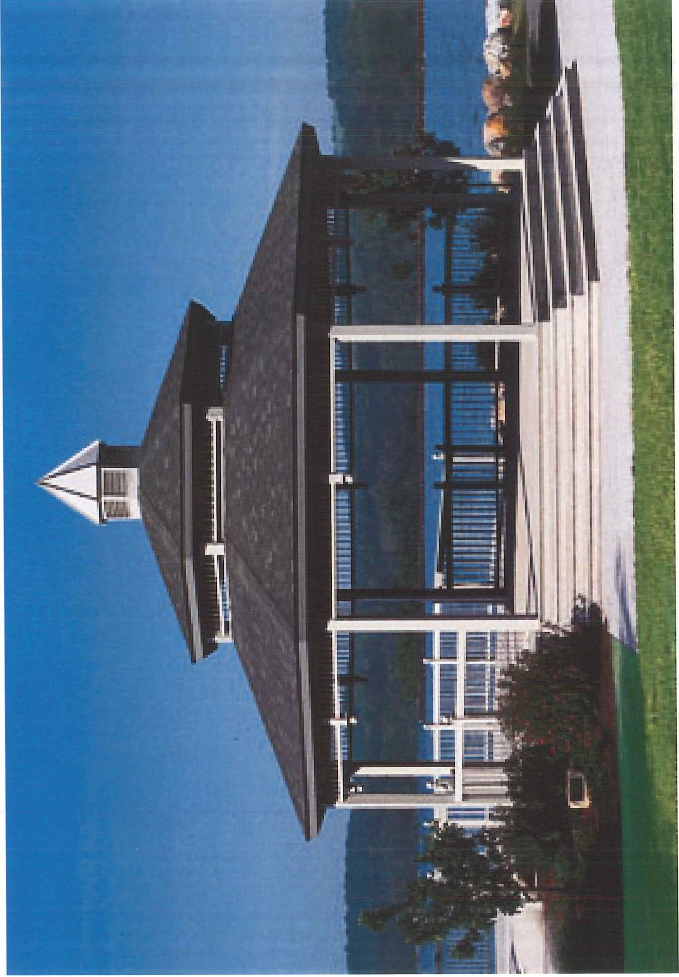
GCO231 W/ OPTIONAL CUPOLA AND ORNAMENTATION