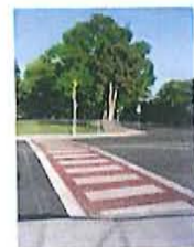
School Crosswalk in Kelowna, BC

From main street crosswalks to entrance ways, parking lots and plazas, we have the right stamped asphalt solution for your project. Our decorative paving technologies are performance-driven and have been proven in a wide range of conditions around the world.