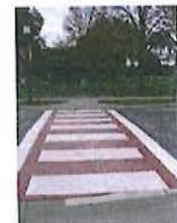
StreetPrintXD Crosswalk in Robbinsdale, MN