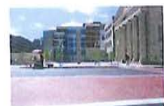
Toledo Arena StreetPrintXD Crosswalks in City of Toledo, OH