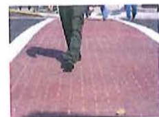
StreetPrintXD Crosswalks in Town of Longueuil, QC