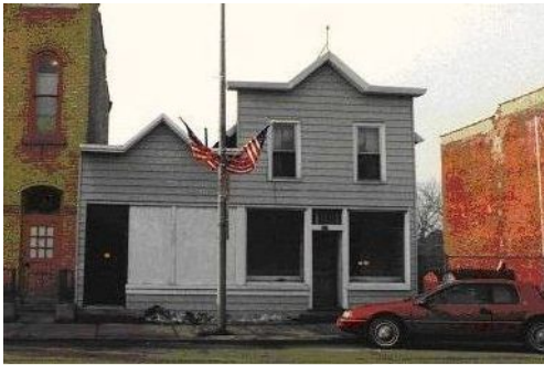
128 and 130 Main Street