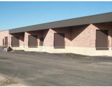
Dock High Doors