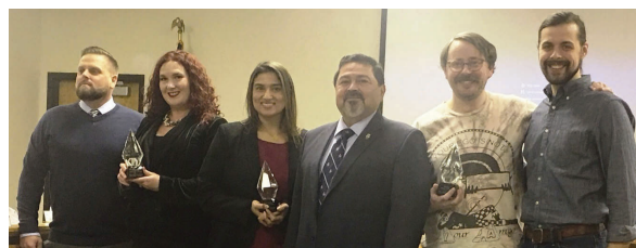
Honorees of the Brilliance in Business Awards at the City Council meeting of Monday, December 3, 2018.

Illinois Car Seat Law – Effective January 1, 2019 there are changes to State law concerning car seats. A chart is available at www.westchicago.org with details of the law. The City, within its Police Department, employs several nationally certified Child Passenger Safety Technicians who can assist you with child safety seat installations and/or inspections of your child safety seat free of charge. Please call (630) 293-2222 if you need assistance.