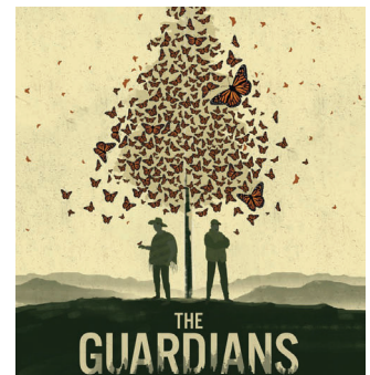
The DuPage Monarch Project contributed to the content in this article.