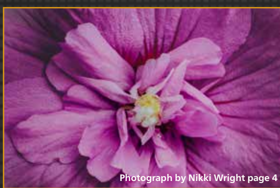
page 4