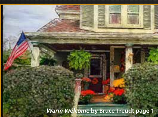
Warm Welcome by Bruce Treudt page 1