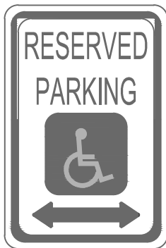
MUTCD R7-8 12" X 18"